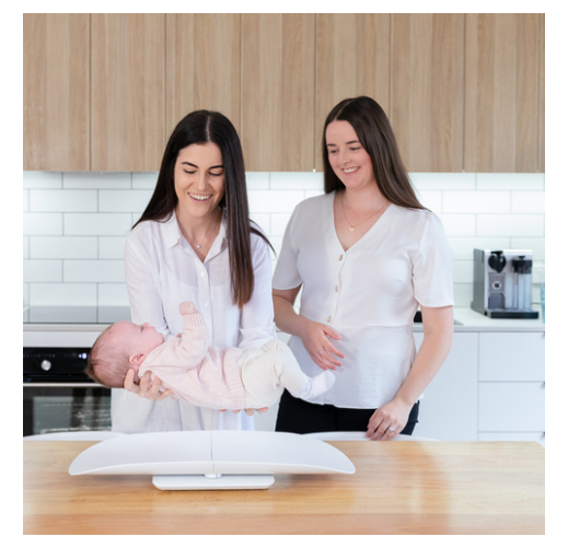
"The moment a child is born, the mother is also born. She never existed before. The woman existed, but the mother, never. ~ Osho